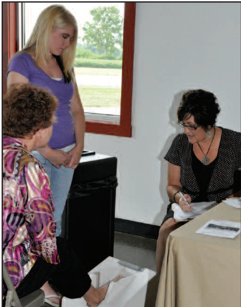
Members participate in the ACRMC health fair.