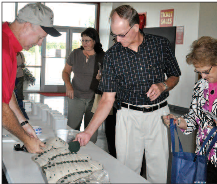
Members receive goodie bags and hats and register for door prizes.