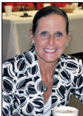
Congresswoman Jean Schmidt joined in the festivities at the 2011 Annual Meeting.

Remember that on Nov. 6, Daylight Saving Time ends. When you set your time back, take a little time